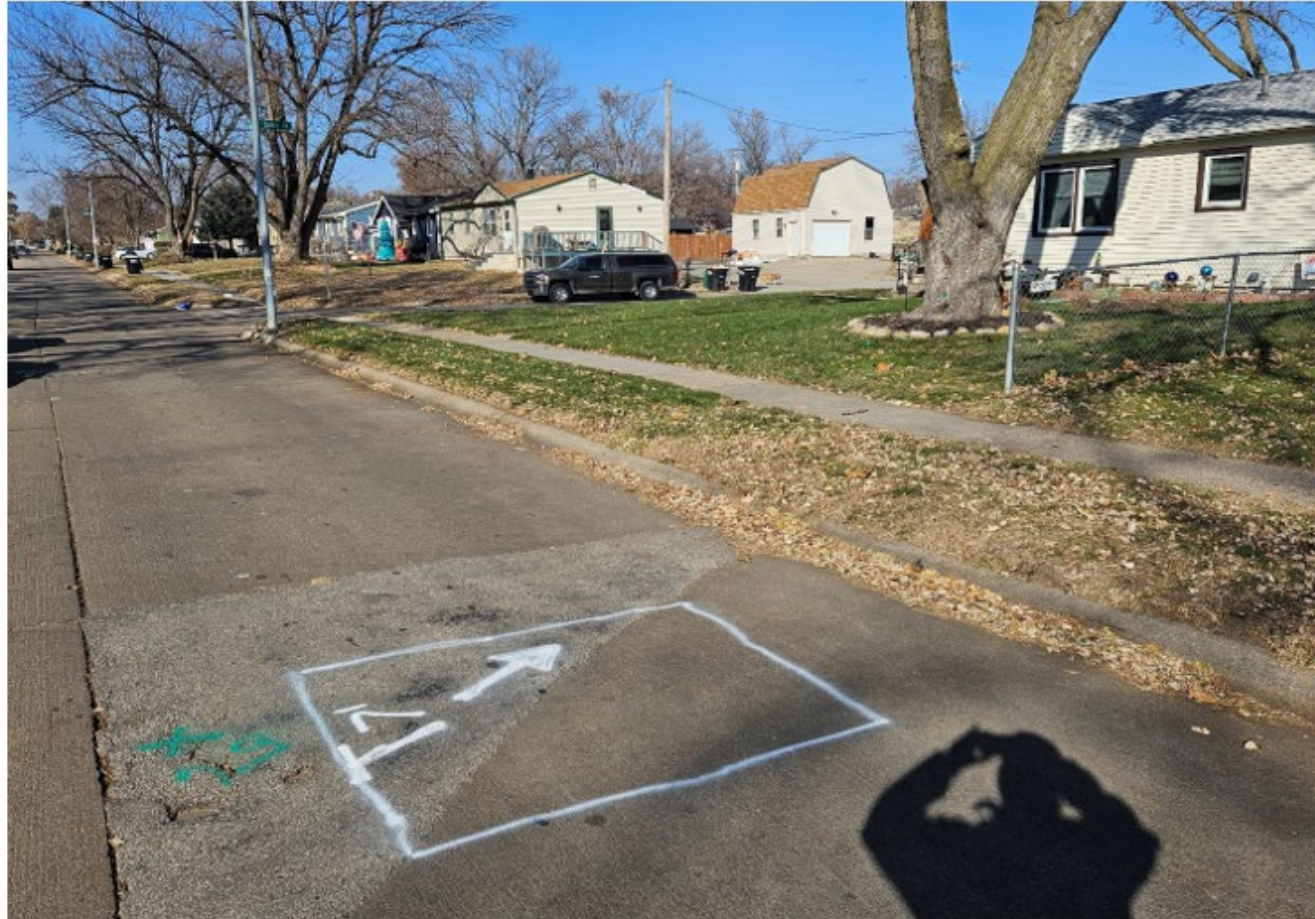
Side View of Property, with street signs in the back left corner of photo. No markings shown expect for the sewer line marked on the street.