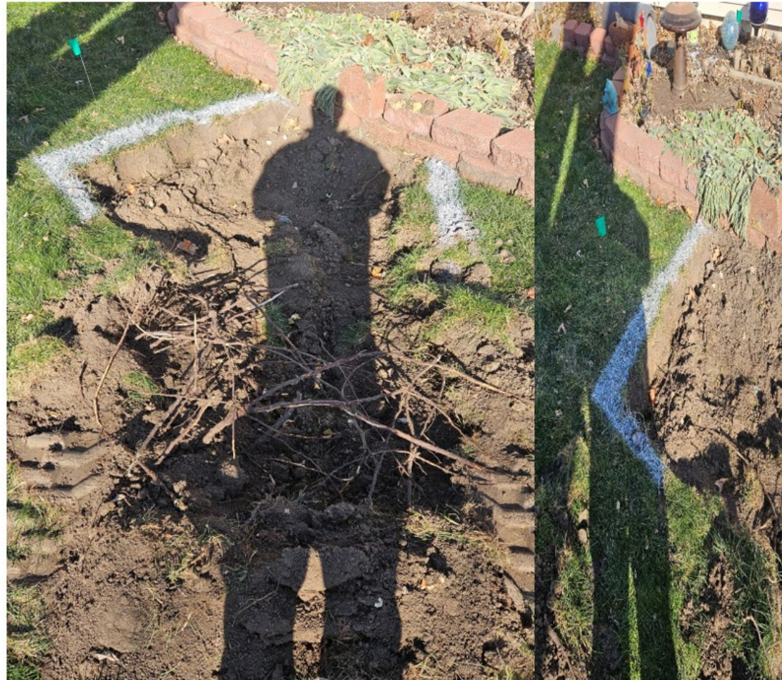
Images of the Excavation and hole in the ground.