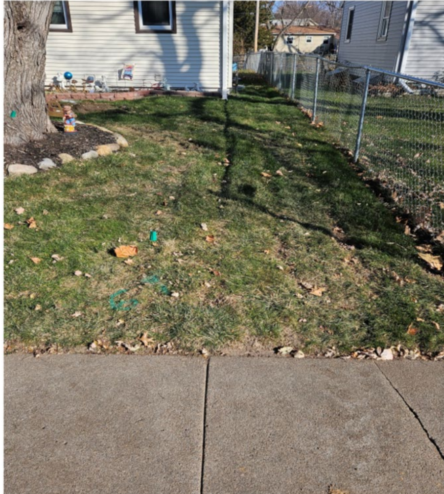
Right side of the residence, green flags and spray paint showing sewer line was located.