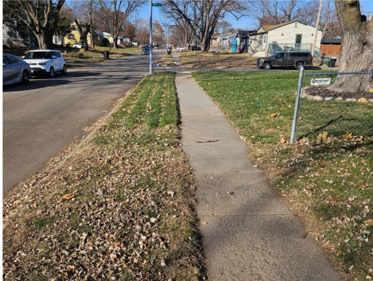
Side walk in front of house, only marking seen is the since green flag placed ' [REDACTED]