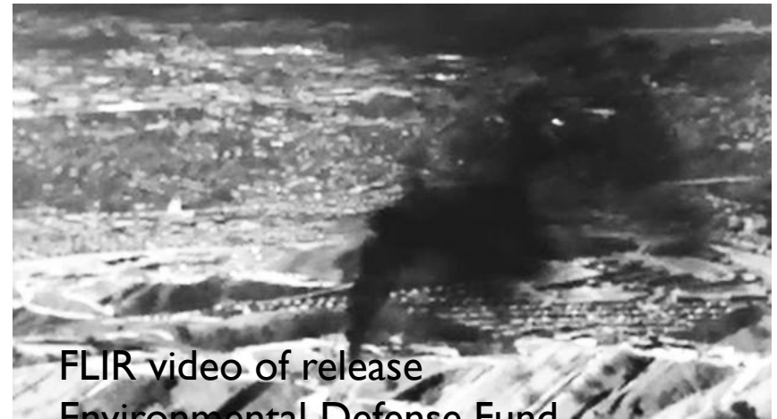
FLIR video of release Environmental Defense Fund